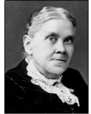
Ellen G. White