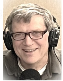
Production and Marketing Director