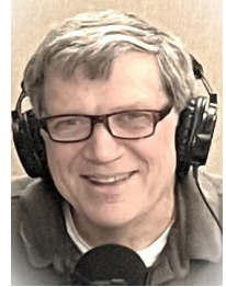
Production and Marketing Director

We are working on many programs for your listening pleasure.