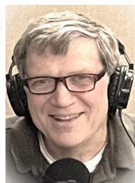
Production and Marketing Director