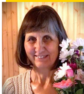
Introduction by Deb Blosser