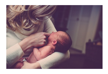
Motherhood (cont'd page 1)

We would like you to partner with us by sharing this information with your with friends and family. We know they will appreciate it!