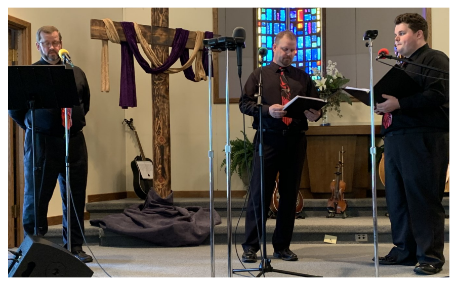
The Story Team Ithaca Radio Variety Hour!

Here are some photo highlights from the February 22nd Ithaca program. A beautiful spring musical treat. Look for it to be aired during our Resurrection Week programming April 10-12.