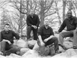
Strong Tower Radio Quartet Are You Ready?

To every new Strong Tower Radio Monthly Supporter you will receive a Strong Tower Radio Quartet CD Are You Ready? The suggested minimum donation is $25 per month while supplies last. This is also available to existing Covenant Partners/Monthly Supporters who increase their support by the suggested donation of $25 month.