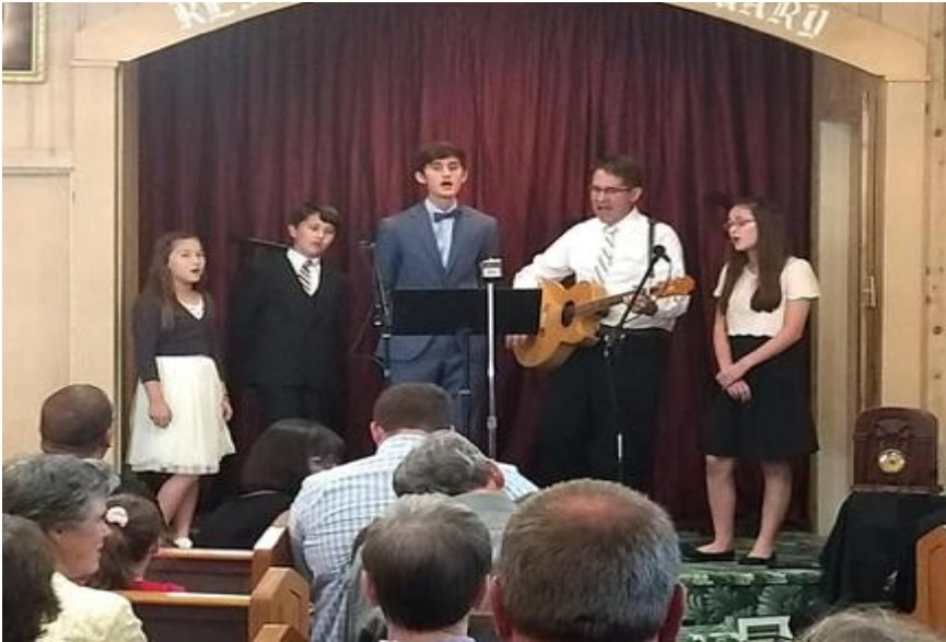
The most recent 'Old-Time Radio Variety Hour'