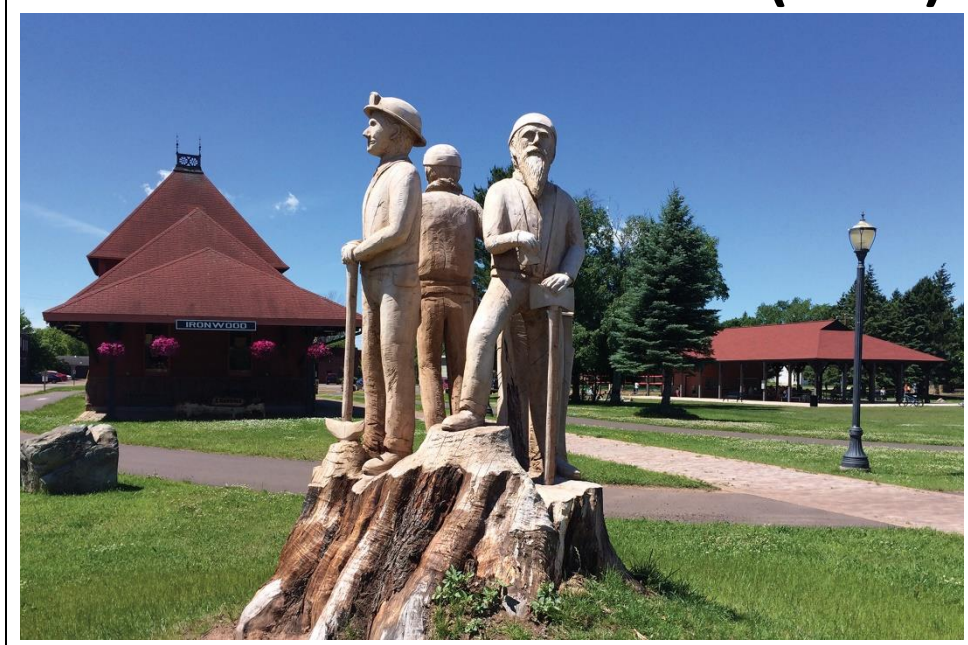
Three Men & the Ironwood Depot

Now for the God thing! Between the amount the anonymous donor gave and the amount the congregation gave, it was the "exact amount needed" to purchase the radio station! Exact! Besides that, the members have pledged a monthly amount needed to help run the radio station after we begin broadcasting! Praise God!